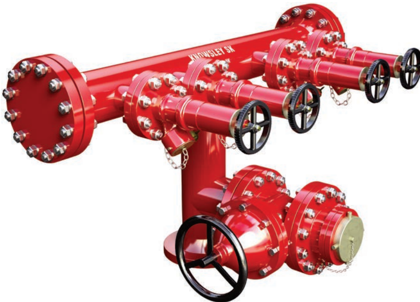
Figure 1 Bespoke Wet Barrel Hydrant Header Layout

Knowsley SK wet barrel hydrants can be manufactured in various sizes, from 3"(80mm) NB single outlet standpipes and spools, to very large, high volume outlets to serve the largest fire fighting equipment on the market.