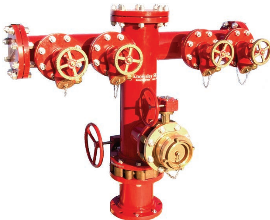
Figure 3 Variant including butterfly isolation and pumper valves, and (non-pressure regulating) globe valves.